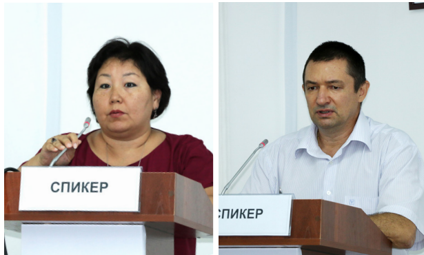
7 th CALP speakers