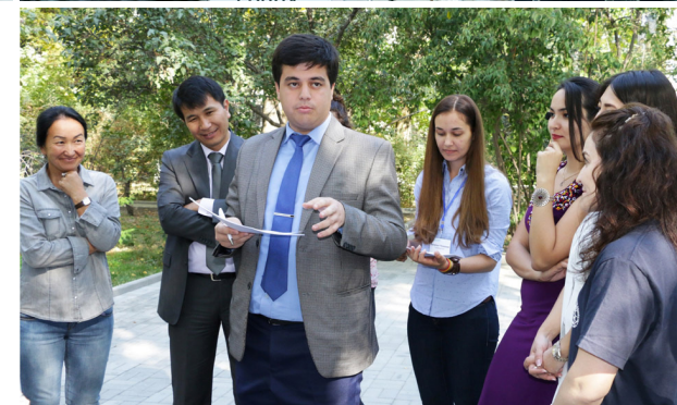
Photo below Programme Leaders in the CAREC garden