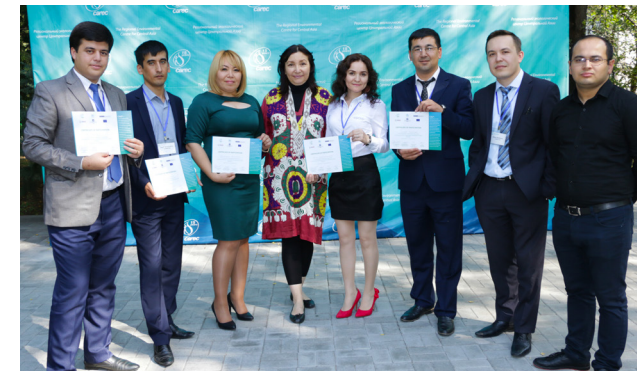
Photo on top Certificate award ceremony of Module I Photo below Certificate award ceremony of Module II