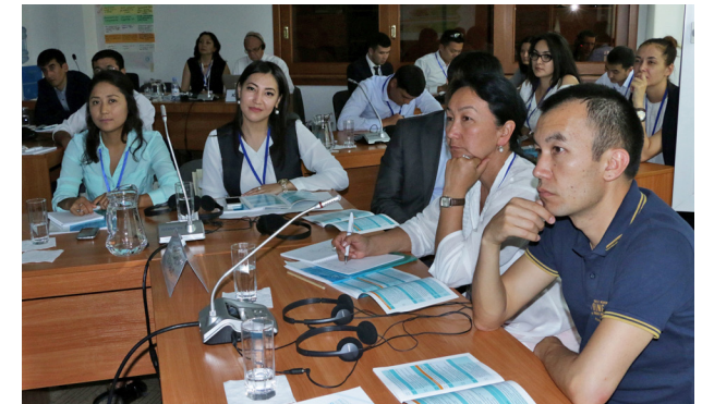
Photo on top Young leaders during the session