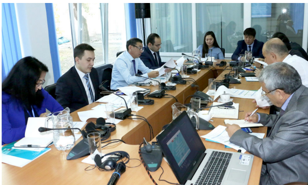
Photo on top Module I participants Photo below Module II session