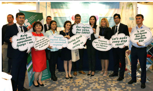
Visit of the Central Asian Water Forum and Exhibition "The Future of Water Resources in Central Asia"