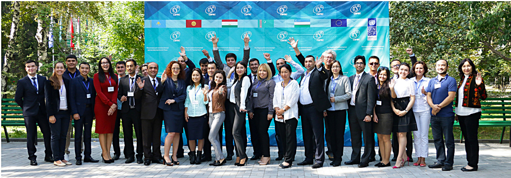
Participants of the 7th Central Asian Leadership Programme

In the course of the 8 days of the event, 38 participants from 6 countries (Kazakhstan, Kyrgyzstan, Tajikistan, Turkmenistan, Uzbekistan, and Afghanistan) shared their experiences, gained new knowledge and examined best practices in the areas of environmental protection, sustainable development, management of natural resources as well as built their leadership skills. Participation of decision-makers, diplomats and parliamentarians in the training yet another time demonstrated the timeliness, success, significance and relevancy of the Leadership Programme initiative.