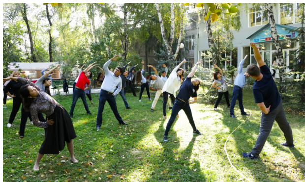
Warming-up in the CAREC garden