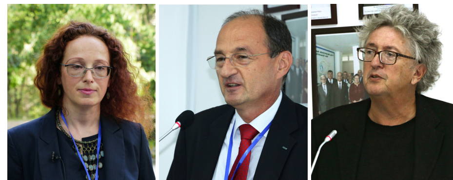
7 th CALP speakers